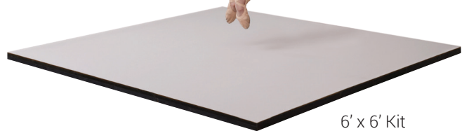
6' x 6' Kit

Call 800-642-6440 to order Home Dance Studio Kits & Glassless Mirrors. All other Home Studio products are available to order online.